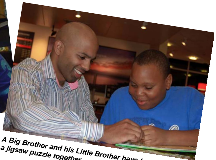
A Big Brother and his Little Brother have fun assembling a jigsaw puzzle together.

Visit us at our new website: www.bbbsde.org